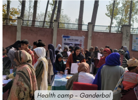
Health camp – Ganderbal

CHINAR International, in collaboration with the Block Medical Officer, Pattan, organized a joint medical camp Harinara, Arampora, Bonichukal, and Shalboni communities enrolled in the Parvaaz program. A team of specialists, including a medical officer, a general physician, gynecologist and counsellors, examined around 500 individuals, including the general public. Prescribed medicines were provided free of cost to children and their parents. Meanwhile, under the Child Development Program, a health camp was organized in Ganderbal district, benefiting 65 individuals. Attendees also received free medicines, ensuring comprehensive support for their health needs.