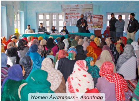
Women Awareness – Anantnag