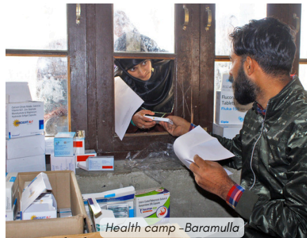
Health camp – Baramulla