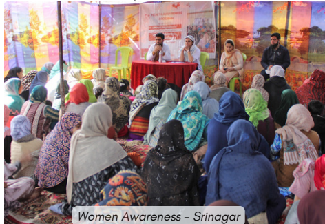
Women Awareness – Srinagar

Additionally, an awareness session on cyber safety was conducted for 14 adolescents in Palpora, Srinagar. This session focused on educating the attendees about various online threats, their consequences and ways to navigate the internet safely.